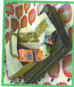
Ham Salad Sandwich (G.SB.S) Veg Sticks, (v) Flapjack (G.SU), Raisins and Milkshake (D)