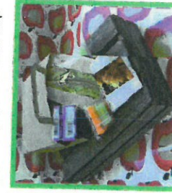
(v) Cheese and Cucumber Sandwich (D.G.SB.S) Veg Sticks, (v) Blueberry Muffin (G.E.D.), and Juice Cup