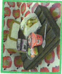
Chicken Salad Wrap (G.) Veg Sticks, (v) Organic Yoghurt (D) and Juice Cup