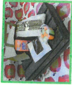
Beef Sandwich (SB.G.S) Veg Sticks, (v), Raisins, Chocolate Crunch Biscuit (G.) and Milkshake (D)