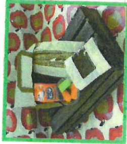
Ham Sandwich (G.SB.S) Veg Sticks, (v) Chocolate Cake (G.E. SB.D.) and Milkshake (D)