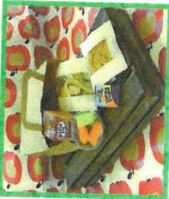
BBQ Chicken Wrap (G) Veg Sticks, (v) Ginger Cookie (G), Raisins and Milkshake (D)

Week 3 w/c 19/6, 10/7, 18/9, 9/10, 30/10