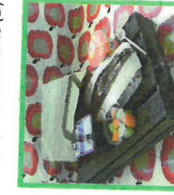
Sausage Salad Baguette (G.S.SU.D.) Veg Sticks, (v) Organic Yoghurt (D) and Juice Cup