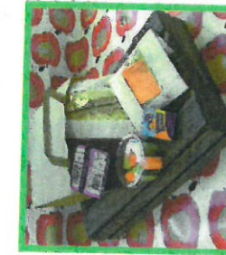
(v) Cheese Mayo Sandwich (G.SB.S.M.D.E), Veg Sticks, (v) Zesty Orange Cookie (G.E), Raisins and Juice Cup