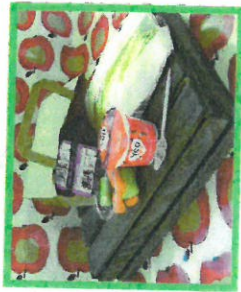
(v) Cheese Baguette (G.S.D) Veg Sticks, (v) Organic Yoghurt (D) and Juice Cup