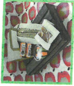
Tuna Mayo Sandwich (G.SB.S.F.E.D.M.) Veg Sticks, (v) Orange/Lemon Drizzle Cake (F.G.) and Juice Cup

Week 1 w/c 15/5, 5/6, 26/6, 17/7, 4/9, 25/9, 16/10