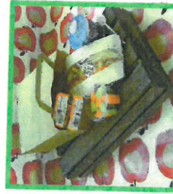
BLT Baguette (G.S.M.D.E), Veg Sticks, (v) Organic Yoghurt (D) and Juice Cup