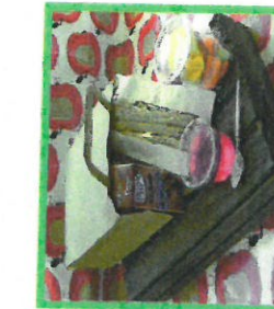
Chicken Sandwich (G.SB.S), Veg Sticks, (v) Jelly Pot, Fruit Wedges (SU) and Milkshake (D)